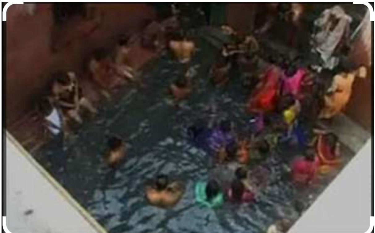
RAJGIR HOT SPRING