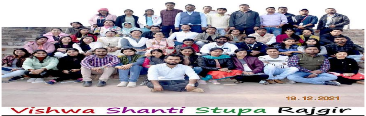
SHANTI STUP RAJGEER